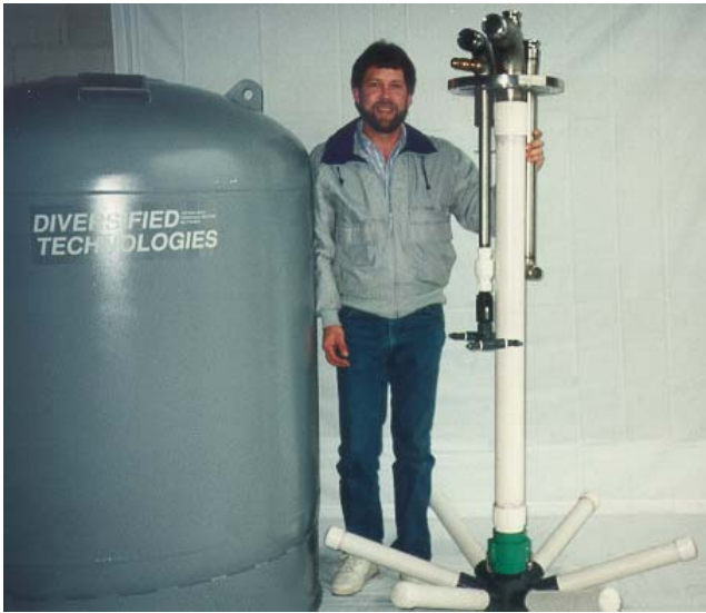
50 cf PreConditioning Filter with core removed (core includes retention elements, sluice line, sluice jets, effluent piping)