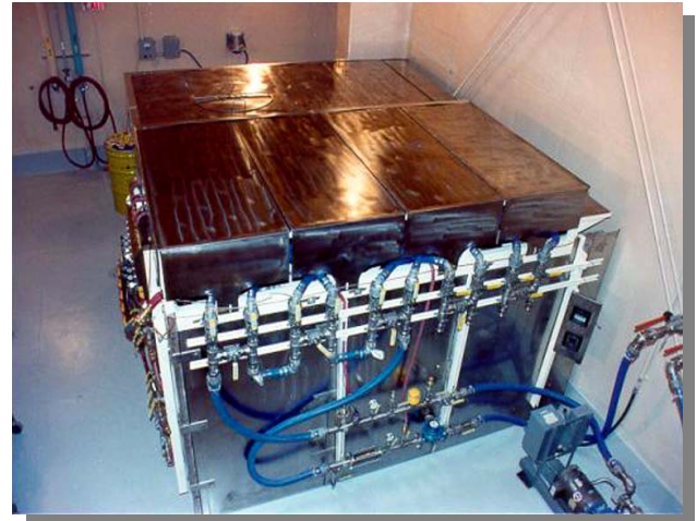
WPS™ with Overhead Canopy Shielding